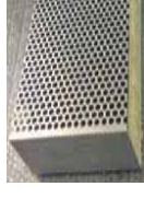
Type: Perforated-Sheet Panels

webra® noise protection products were specially developed for use in the shooting sector.